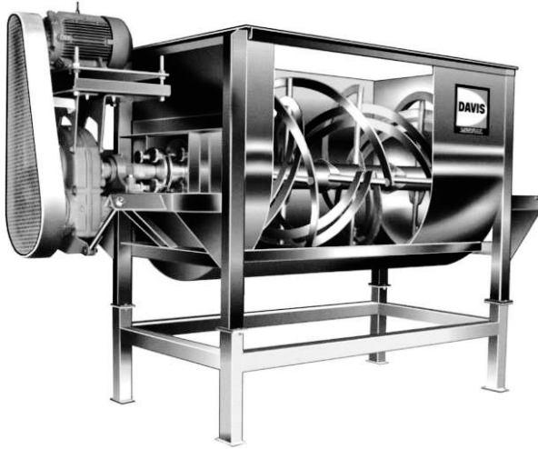
Figure 2.1 A picture of a “precision mix batch mixer” that would be used to mix large quantities of foods such as peanut butter and other mixes of substances that have relatively high values of density \rho and viscosity \mu.

Dimensional analysis developed as an attempt to perform extended, costly experiments in a more organized, more efficient fashion. The underlying idea was to see whether the number of variables could be grouped together so that fewer trial runs or fewer measurements would be needed. Dimensional analysis produces a more compact set of outputs or data, with perhaps fewer charts and graphs, which in turn might better clarify what is being observed.